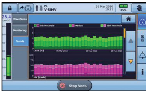
Monitoring options with at-a-glance visuals

Real-time waveforms: Pressure and flow waveforms are quickly accessible on Astral's large color touch screen, while offering continuous patient trending.