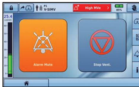
Big button for greater accessibility

Big button: Included for quick access to start or stop ventilation, as well as to mute alarms, this feature is particularly useful for those with impaired dexterity or eyesight.